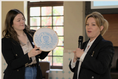
Embroidered school crest