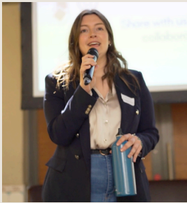
Water bottle from the Scouts