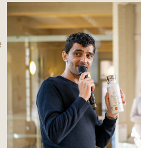
Water bottle with a map of the world